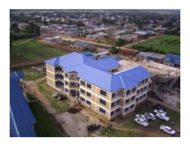
Kibuye Hope Hospital Kibuye, Burundi

The hospital is currently small, with only 85 beds, but planned development will expand it to 300 beds with life-saving modern technology over the next ten years.