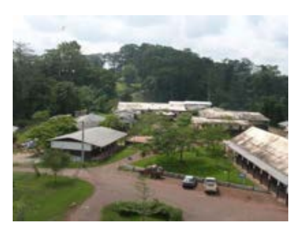
Bongolo Hospital Lebamba, Gabon

Today, the 158-bed hospital in the rural town of Lebamba includes busy Surgery, Adult Medicine, Maternity, Pediatrics and Emergency departments, as well as one of the busiest eye-clinics in Gabon. Full- service HIV, TB, and Dental clinics round out the services.